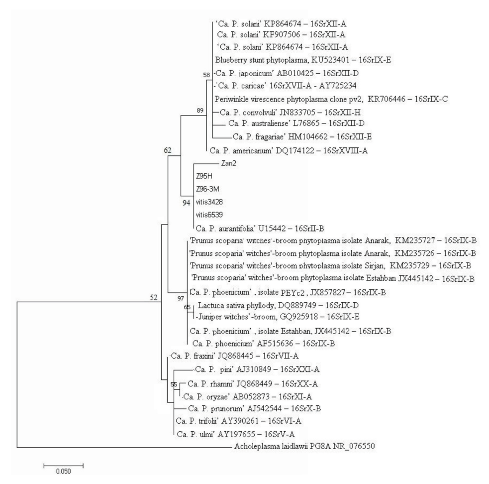
Fig. 3. Molecular Phylogenetic analysis by Maximum Likelihood method. The evolutionary history was inferred by using the Maximum Likelihood method based on the Tamura-Nei model. The tree with the highest log likelihood (-476.95) is shown. The percentage of trees in which the

Three leafhopper species including P. shirazicus , A. ribauti and P. alienus were collected from Qazvin province (Iran). P. shirazicus was recorded as a pest on almond with mild economic importance by Rajabi (1991). The species is known as an endemic species to Iran, distributed in central Alborz mountain and southwest of the country (Mozaffarian and Wilson, 2016). Due to the lack of any report on the serious damage of the species, it was suggested by Mozaffarian (2018) to evaluate the real pest status of the