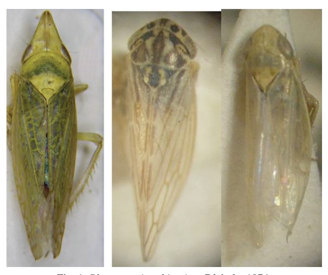
Fig. 1. Platymetopius shirazicus Dlabola, 1974, Agallia ribauti Ossiannilsson, 1938, Psammotettix alienus (Dahlbom, 1850)

RFLP analysis of the R16F2n/R2 and M1/M2 products with Taq I and Mse I (Fig. 2) indicated that the phytoplasmas from grapevine leafhoppers in Qazvin province (Iran) are mixed infection of two different group 16SrII (' Candidatus Phytoplasma aurantifolia') and 16SrXII group ( Ca. P. solani', "stolbur") (Fig. 2). But single infection was observed in three populations of seven positive populations that related to A. ribauti species. Sequencing and blast analysis of these samples indicated that this phytoplasma related to the 16SrII (' Candidatus Phytoplasma aurantifolia') group and shared 100% similarity