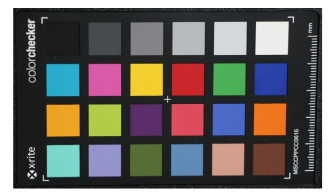
Fig. 1. Colors of the X-Rite ColorChecker

image. One result can be seen in Fig. 2 , where the upper shadowy image was corrected and more accurate colors achieved (look at the most right colors).