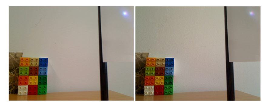
Fig. 7. Images under 3500K CCT (fl. lamp) and 6200K CCT conditions (dif. day)

In the second trial, the question was what the AWB function of the c905 camera is good for. Two images were taken with AWB settings under two different illuminations. One was a simple fluorescent lamp (fl. lamp), typical in offices with a CCT of 3500K, natural white. The second one was a diffuse, non-direct daylight (dif. day) which is close to a CCT of 6200K, shadow. Hence the AWB setting, the camera compensated for the different WB illumination conditions ( Fig. 7 ).