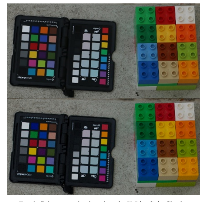
Fig. 2. Color correction based on the X-Rite ColorChecker