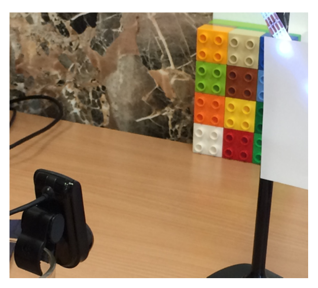
Fig. 3. One setup of the measurement with the Logitech c905 camera

calculated from the R,G,B differences as using them for the pixels R,G,B-channels as a coefficient. See these ratios below ( Table I ). Using this transformation, all the pixel colors in the high color temperature image were changed, resulting in a corrected image. That image should be close to the low color temperature image. 2x4 pictures have been investigated. Four were taken with low correlated color temperature settings, four with high CCT settings. The cropped RGB LED image parts (R1, R2, G1, G2, B1, B2) are shown below in Fig. 5 . The white LED had not been included; later it will be explained why.