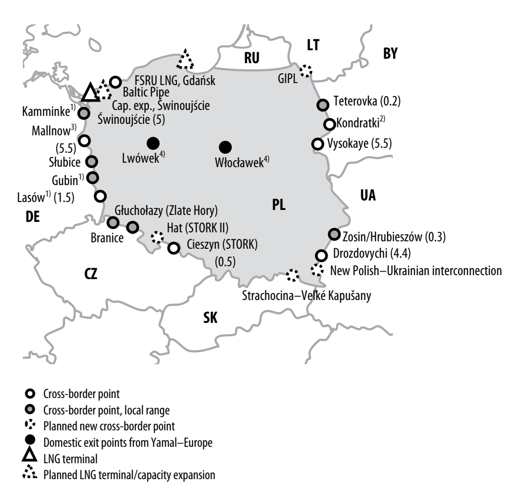
Figure 2. Cross-border pipeline gas and LNG import capacity into Poland

1) Effective April 2016, the existing cross-border connections at Lasów, Gubin and Kamminke were replaced with a single point called GCP Gaz-System/Ontras (its capacity is 1.6 bcma).