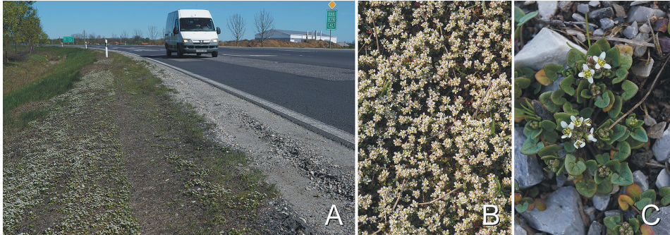
Fig. 2. – Cochlearia danica on the side of road E79 near Biharkeresztes (Hungary). A – roadside habitat; B – patches with high density of flowering individuals; C – sporadic occurrence of individuals at the edge of a roadside.