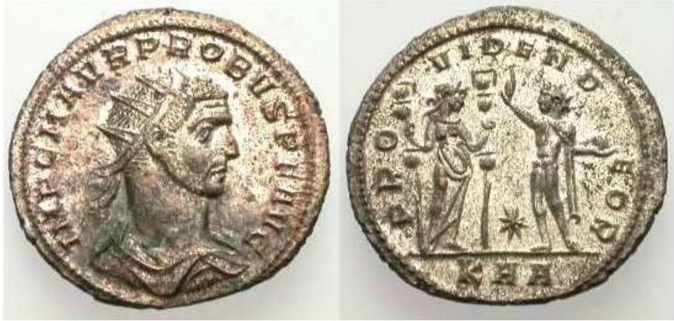
Fig. 2. RIC V-2 Probus 844

to be a legitimizing one of a martial nature, gradually intensified in the 3rd century. This evolution may be illustrated by the modifications of the military and provincial model taking place under Gallienus, Aurelian's manu militari reunification, the multiple internal wars, or the great reorganization undertaken by the Tetrarchy. Some of Aurelian's coinages may be understood in this context: RESTITUT ORBIS and PACATOR ORBIS . 17 As regards Gallienus (253–268 AD), the connection made by Lukas de Blois 18 between the redistribution of imperial mints and military needs is particularly noteworthy. These changes trigger the decentralization of direct imperial control over coins. This fact could be linked to the subsequent situation of the Roman mint and emperor Aurelian's reaction by taking control over it in the early stages of his reign. 19