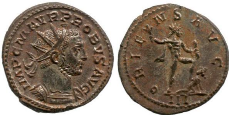
Fig. 5. RIC V-2 Probus 45