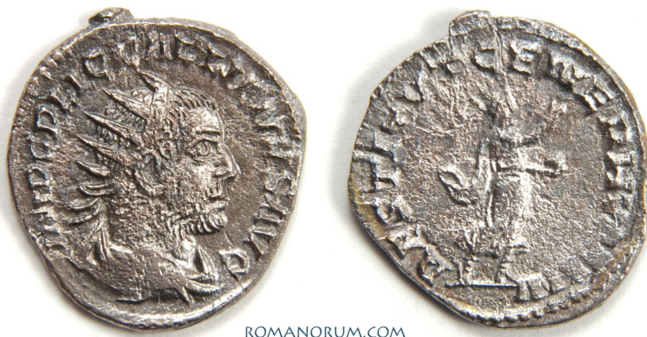
Fig. 3. RIC V-1 Gallienus 296

Invictus , 30 whose full name was used for the first time under Gallienus (RIC V-1 119 31 ).