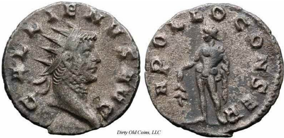
Fig. 4. RIC V-1 Gallienus 468

under Gallienus. The reign of this emperor is particularly noteworthy, more so if we bear in mind that the sole exception to Apollo conservator is none other than Apollo Palatinus . This could possibly relate to Augustus or the Ludi Apollinares ; in any event, the god is unquestionably linked to the sphere of imperial rule. This is nothing exceptional as the rest of the Roman pantheon were used in the same way: a remarkably emphatic use of the traditional language focused on the preservation and legitimation of the emperor. Apollo can thus be seen as a conservator under emperors Aemilian (253), Macrianus (261), Quietus (260–261), Valerian (253–260) and Gallienus (253–268).