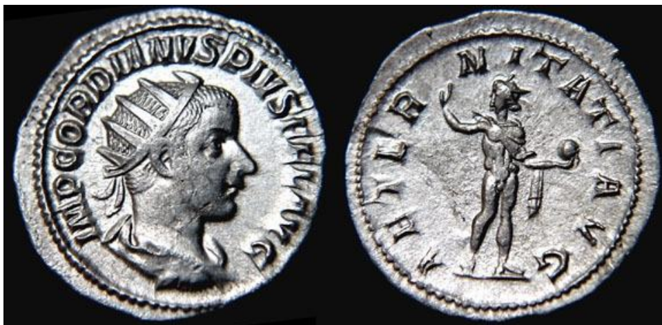
Fig. 1. RIC IV Gordian III 83

further legends and iconographies were added: a solar frontal quadriga 12 (rare in previous imperial iconography); linked to providentia bearing the legionary emblems; 13 defeated enemies at the feet of Sol; 14 the god as the emperor's comes ; 15 as claritas of the emperors during the Tetrarchy 16 ... The traditional representation of Sol standing, however, continues to be predominant. Most changes consist of a modification of the legend or of the addition of new elements within the field or the exergue. [Fig. 2]