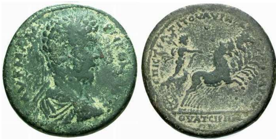
Fig. 6. MIONNET (n. 61) IV 914

representation, where the figure is identified as Helios or the emperor. 63 A more thorough analysis reveals the existence of some very similar coins in terms of iconography depicting Helios in an identical manner (with no axe) in Anatolia during the same period. A good example could be the case of Helios on a quadriga in the nearby city of Tabala. 64 Both cities are in Lydia, far enough from Syria to be considered under the same regional influence as Semite solar gods, meanwhile the double axe was an important symbol of some gods in Caria.