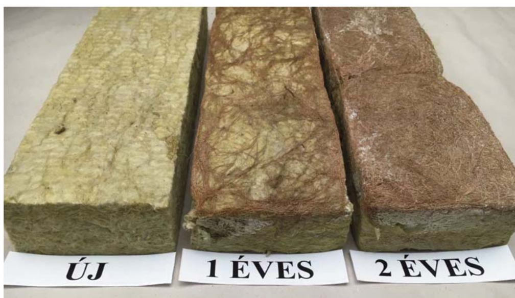
Figure 3. Rockwool slabs (upside down) from the experiment: before usage (left), after the first growing season (center), after two growing seasons (right)