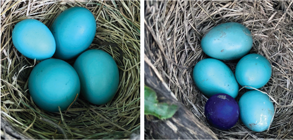
Fig. 1. Experimental clutches of American Robins, each with a robin-blue (mimetic; left) or a deep-blue (non-mimetic; right) model egg 3D printed in the size, shape, and weight of natural Brown-headed Cowbird eggs

I did not conduct a 6th treatment type of applying the natural cowbird scent to the non-mimetic model eggs, but this could be conducted informatively in a future study.