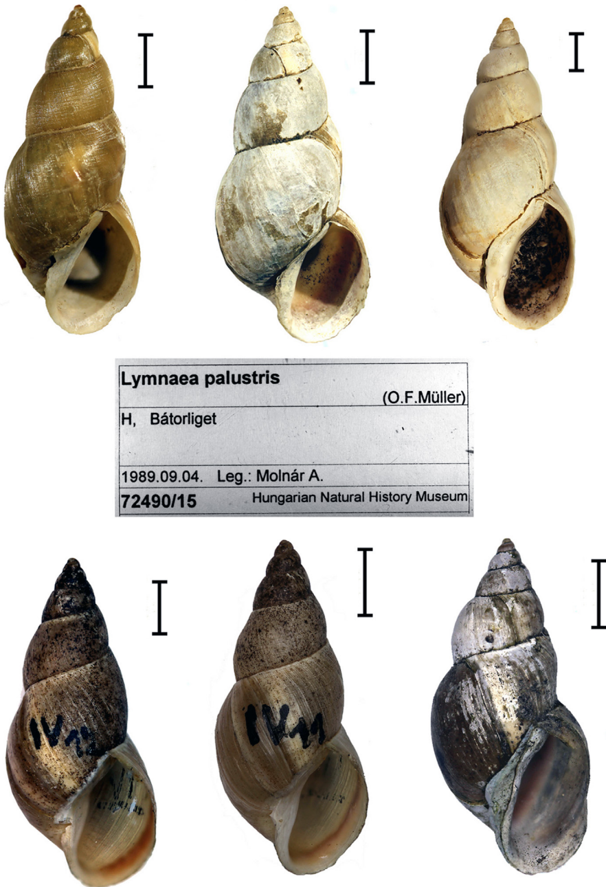
Fig. 1. Shells of Ladislavella occulta from Hungary and Poland. Upper row – Hungary, Bátorliget (HNHM), lower row – three paratypes of this species from Rawicz, Poland (ZIN). Scale bars: 2 mm