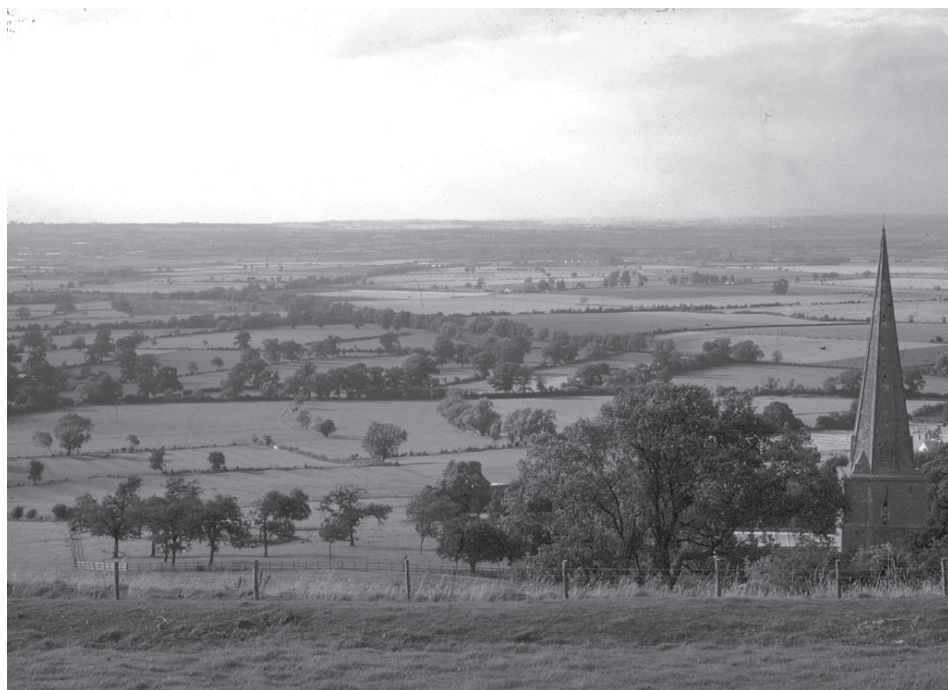
Figure 5. Enclosure fields in the Vale of Evesham, Worcestershire

common village herd. Throughout the 18 th century, enclosure progressed rapidly and by the middle of the century open field had been drastically reduced in most counties. At first a cumbersome business, the General Enclosure Act of 1836 greatly facilitated the change and the landscape of the open field regions gave way almost everywhere to one of straight-sided large geometric fields, often bounded by quickset hedgerows. These still dominate the present-day field pattern of much of lowland England (Figure 5). New farms were established beyond the village centres to farm the new fields. A system of ploughing normally carried out in the open fields was the use of ridge and furrow, particularly because it facilitated drainage in the days before land drains became available. Even after former arable land had been enclosed, relict ridge and furrow often survived if the land was later left under grass.