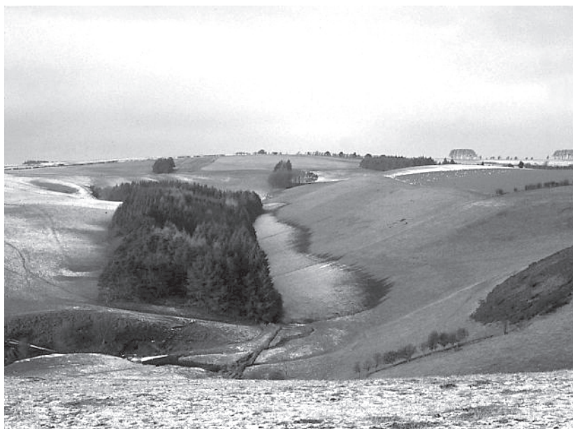
Figure 6. Clun sheepwalks, Shropshire, upland sheepwalks enclosed in the final stages of 19 th -century enclosure

6. ábra Clun birkajárás, Shropshire, lekerített felföldi birkajárások a 19. századi privatizáció végső stádiumában