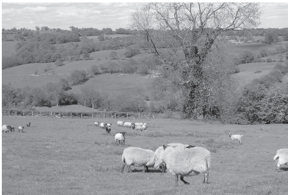
Figure 7. Ancient hedgerows in the Monnow Valley, Herefordshire 7. ábra Ősi sövény a Monnow-völgyben, Herefordshire

The moves advocated were not always beneficial for landscape conservation – former downlands and traditional pastures were broken up for intensive grain production as England tried to become more self-sufficient, continuous cultivation maintained only by the addition of vast amounts of chemical fertilizer; hundreds of miles of ancient hedgerows were destroyed to make way for bigger farm machinery (Figure 7).