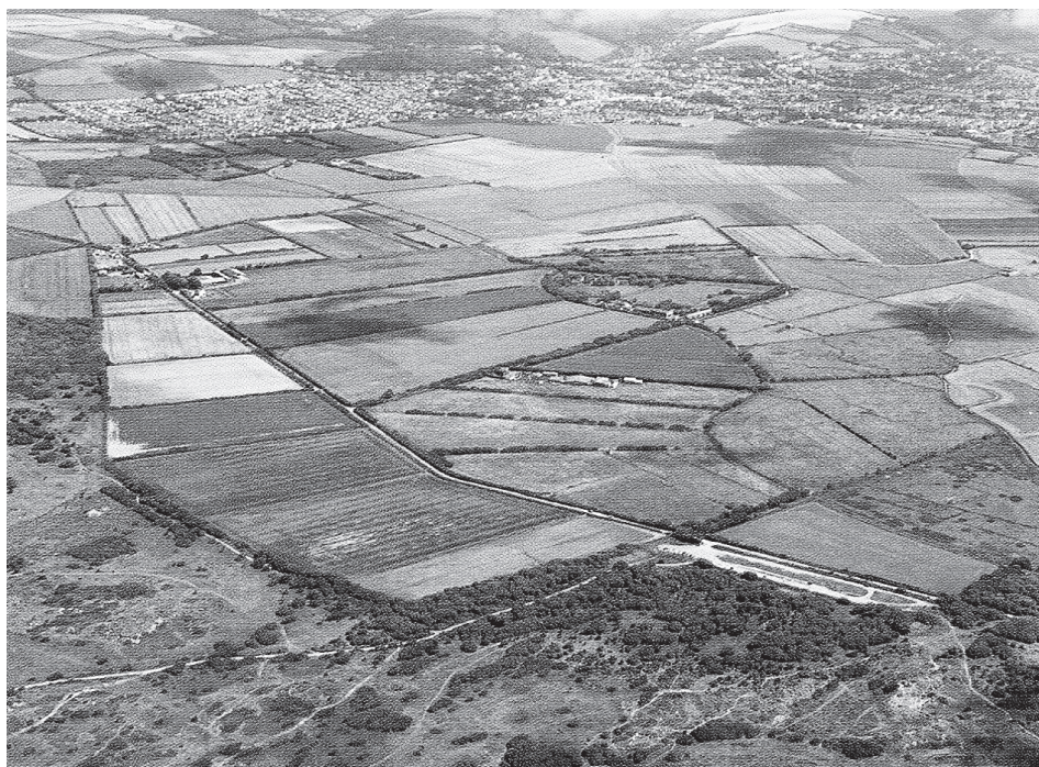
Figure 2. Brauton Great Field, a further open field survival in south-west England. 2. ábra Brauton Great Field, egy újabb megőrzött nyílt terület DNy Angliában.

These are precious survivals of what, in this country, is a lost practice and it is to be expected that modern changes in farming in other European countries will not totally eradicate these open-field landscapes. They help to show, firstly, how our man-made landscape has evolved, and, secondly, they contribute towards the preservation of regional countryside character.