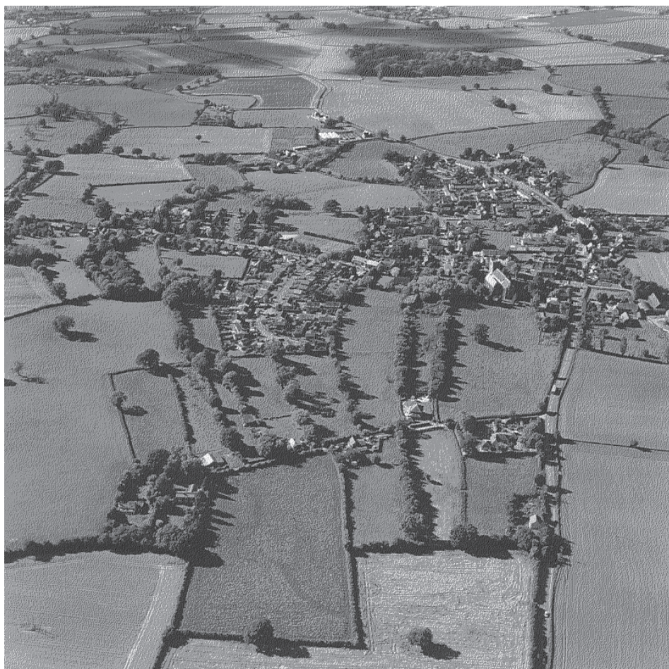
Figure 4. Surviving strip fields at Madley, Herefordshire, in the Welsh Borderland (NMR 23718/10 SO 4238/12 taken 24 September 2004 ©English Heritage)

4. ábra Megőrzött nadrágszjij parcellák Madley-ben, Herefordshire, a wales-i határ környékén (NMR 23718/10 SO 4238/12, készült 2004 szeptember 24-én ©English Heritage)