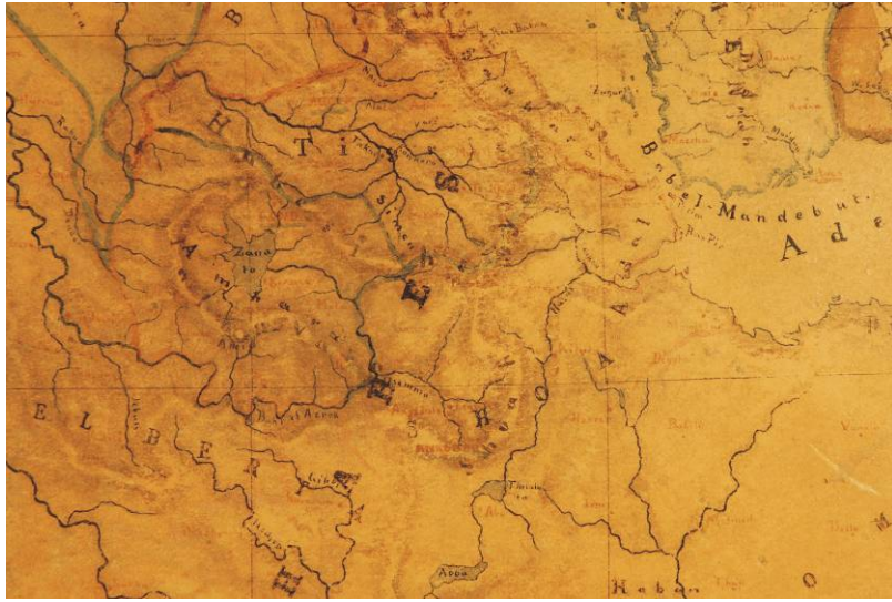
Figure 2. A part of Perczel's globe as it is today