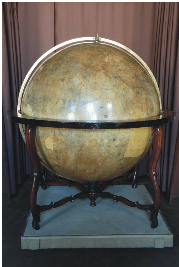
Figure 1. A unique Hungarian manuscript globe of László Perczel

Both versions will be placed in the Virtual Globes Museum and will serve the safeguarding and popularisation of the Hungarian cultural heritage both for the Hungarian and international professionals and public.