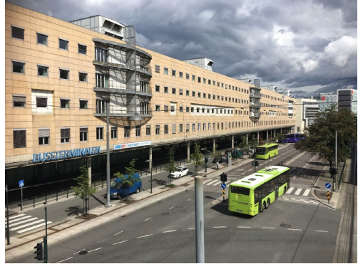
Picture 3: Gallery Oslo – proposed as a new home for the library in 1991

In 1988, Gallery Oslo, an indoor shopping street, 400 meter long, built above the central bus station opened. It was launched as Europe's longest indoor shopping street, where boutiques and restaurants should give Oslo a flair of Rome, Paris and Tokyo. The concept, however, soon turned out to be a failure. It had difficulties in attracting shops and restaurants, and the few which established themselves there, soon fled. When the newspaper Aftenposten in 2008 arranged a popular vote to select Oslo's ugliest building, Gallery Oslo won the competition.