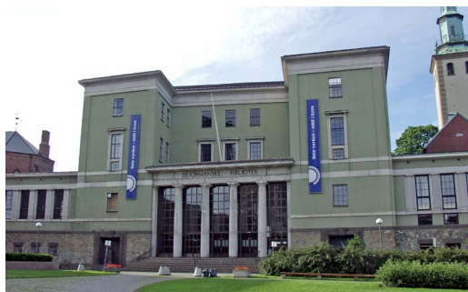
Picture 2: The old central library at Hammersborg which was the home of Oslo public library 1933-2019