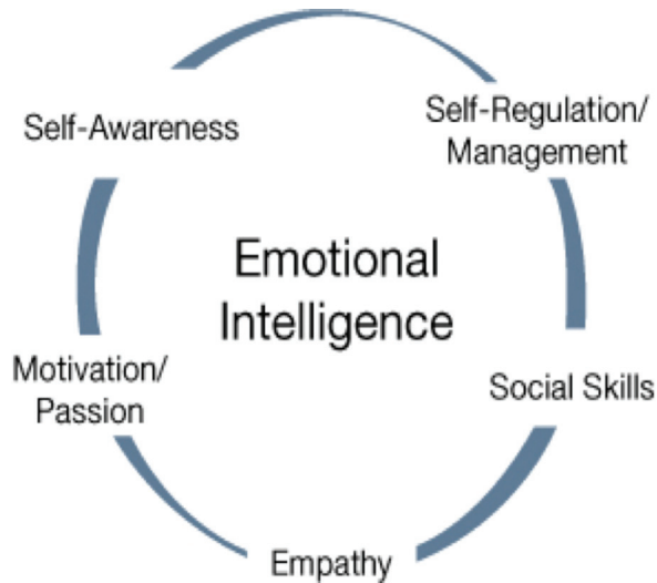
Figure 1. Joint competencies of the leader with vision. [5] [3: 782]

We can see that the issue of leadership effectiveness and responsible behaviour is much more complex and goes beyond whether a person is professionally competent to fill the position. Considering not only the present behaviour and roles, but also the importance of the new leadership competencies of a leader, we can say that leaders being responsible for the organization have to be “leaders with vision.” [3: 782] To meet this expectation a leadership attitude is needed that we can characterize with five basic joint competencies, based on the Goleman-model. [5]