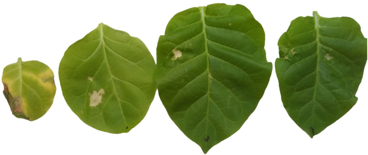
Figure 2. Damage caused by 30% (v/v) H_2O_2 four days after injection into the second, fourth, sixth, and eighth leaves (from the left to the right) of a two-month-old cv. Samsun tobacco plant.

There is a general reaction of plants to abiotic and biotic stresses; a rapid accumulation of reactive oxygen species (ROS) [14–16] can damage practically all cell constituents, but they can also serve as defence signals [17,18]. The complex role of ROS and the antioxidant systems in disease development and immunity has been discussed several times [19–21]. During aging, the antioxidant capacity of plant tissues is generally decreasing [22]. Figure 2 shows that the largest damage is caused by the reactive oxygen H_2O_2 on the oldest leaf and the smallest damage on the youngest leaf of the tobacco plant, which indicates the lowest and highest antioxidant capacity, respectively.