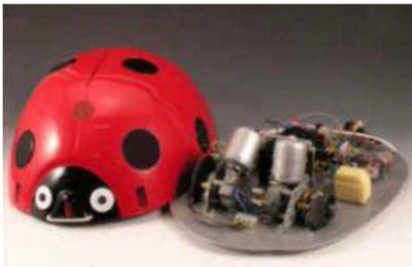
Figure 3: Muszka's Electronic Ladybird