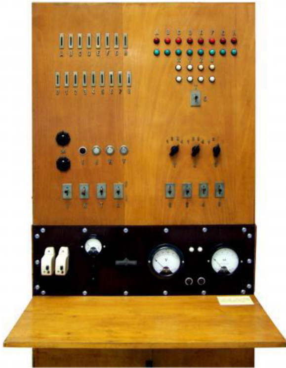
Figure 2: The Kalmár's logical machine

in 1957. (The machine was presented at the University on 1 May 1958.) This was the environment in which László Kalmár's formula-driven machine and Dániel Muszka's Electronic Ladybird were created. 5