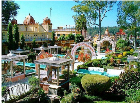
Figure 6 Ashram in Rishikesh, in Northern India

publicity; they could be found in a place where there is no way for the everyday person to go. But would the everyday person be able or even want to have the qualities expected of a true chela (disciple)? That is, to renounce all worldly possessions and abandon loved ones to reach the depths of yoga.