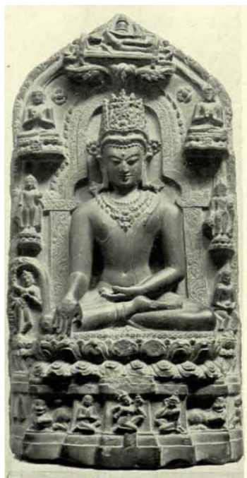
Figure 3. Buddha from Bengal in Museum of Fine Art, Boston, USA

The earliest form of yoga was meditation. In ancient oriental art, the Buddha was often characterised in meditation with his knees bent, one of the classic yoga sitting positions (padmasana). This was the first asana, practised by masters to enable them to meditate for long periods in a stable pose without moving. ( Figure 3 and Figure 4 )