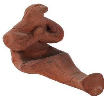
Seated male in Namaskar pose 3072/388 Terracotta Harappa 2700-2100 B.C.E L: 5 Ht: 4 W: 2 cm