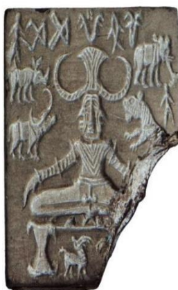
Pasupati Seal DK 5175/143 Steatite Mohenjodaro C. 2500-2400 BC 1-6/16 x 1-6/16x ¼ Inches

The origins of yoga are disputed. Archaeological excavations have found many artefacts from the ancient Indus Valley civilization (Harappa Civilization), which flourished around 2500–1700 BC [2]. Stone seals from these excavations showed figures sitting cross-legged with arms outstretched and resting on knees. Archaeologists and historians assume that they depict meditating figures, and this civilization already knew and practised yoga. (Figure 1) Another piece of artefacts is a small male torso in seated postures with hands pressed together such as in Namaskar pose (or Anjali mudra) [3] and as if he was doing abdominal breathing. However, these associations with yoga practice are only hypothetical [4]. (Figure 2)