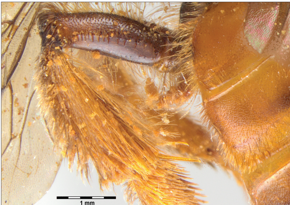
Fig. 1: Andrena harisi sp. n.: hind femur and tibia

The new species is yet known only from the eastern region of Libya, the Cyrenaica.