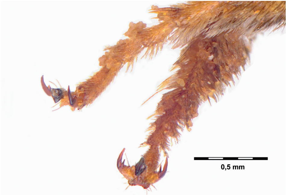
Fig. 5: Andrena harisi sp. n. holotype: bidentate claws of hind and middle leg