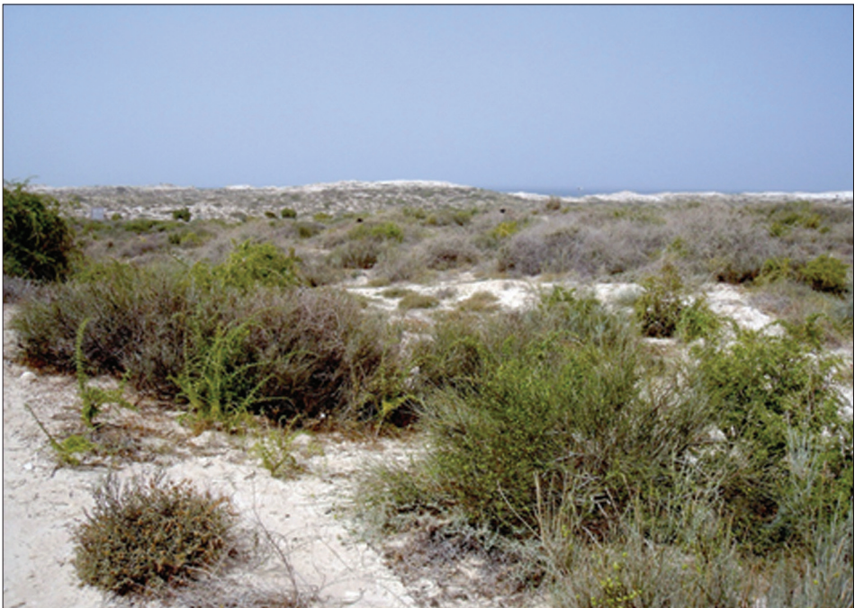
Fig. 6: Subcoastal area of the Sahara desert, partly covered with semi-desert spiny scrub vegetation, the locus typicus of Andrena harisi n. sp..