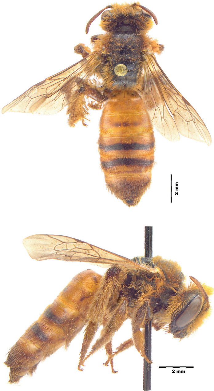
Fig. 2: Andrena harisi sp. n. holotype: dorsal and lateral view