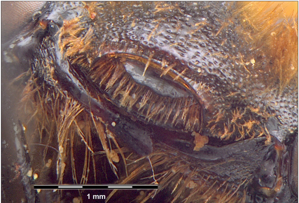
Fig. 4: Andrena harisi sp. n. holotype: labrum