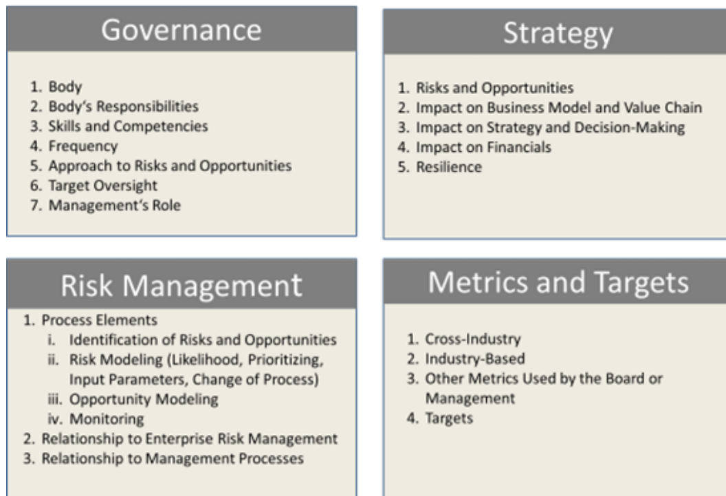
Figure 1: Structure of IFRS 2, based on IFRS 2.5–37

IFRS S2 focuses on climate-related disclosures. Its objective is to provide information about the reporting entity’s exposure to climate-related risks and opportunities, its effect on the entity’s cash flows, and its access to finance or cost of capital over the short, medium, or long-term ( IFRS S2.2 ).