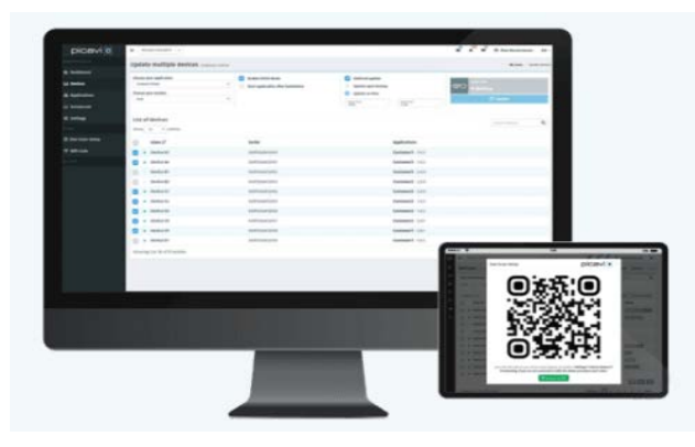
Figure 2. Picavi Cockpit

Mobile device management in Picavi Cockpit lets you economically control and manage your smart glasses. This makes it easy to ensure they are working correctly. With our one-scan setup, we have made adding new glasses to the inventory even easier. You can start the configuration just by scanning a barcode. The glasses are then ready for use after just a few steps [8].