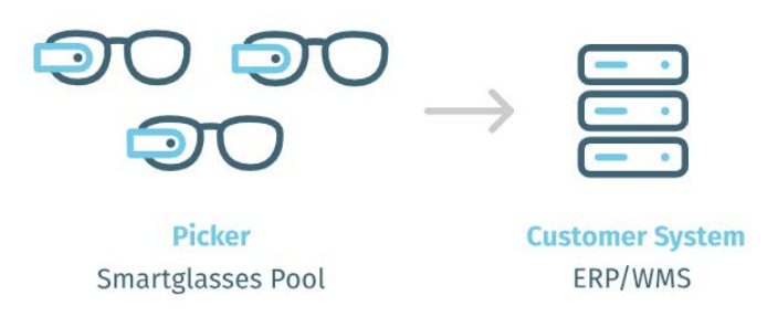
Figure 4. Warehouse connection system

Picavi Pure is exceptional because it sets up so quickly. The order-picking system also remains flexible during operation, allowing you to restructure stock or change processes easily.