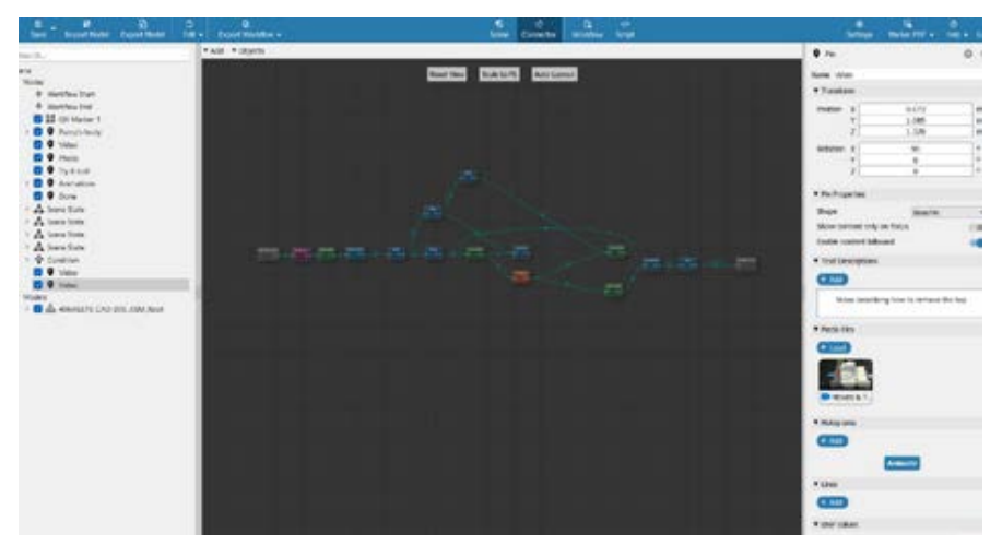
Figure 5. Preparing tutorials in the program

However, Continental was looking for a different solution to create augmented reality tutorials to train operators at two sites on the new production line. One that would not only display text and images but also more advanced animations and work with 3D models of the real components that the operator would be assembling at that station. The solution tested for the pilot operation ended up being a combination of Microsoft HoloLens 2 smart glasses and TeamViewer Frontline Spatial software.