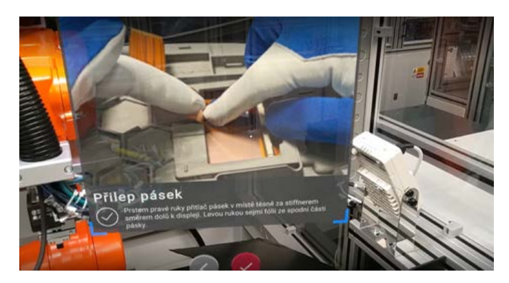
Figure 6. TeamViewer Frontline Spatial allows you to work with 3D models and create animations

TeamViewer Frontline Spatial extends the Frontline platform with 3D augmented reality capabilities. It is a very user-friendly tool with an attractive environment. Clear instructions and navigation make working in it intuitive and efficient. Even after a short introductory training, any employee can create high-quality 3D workflows without having advanced programming knowledge. The preparation of digital instructions can therefore be entrusted to less experienced staff, freeing up capacity for dedicated engineering teams [11].