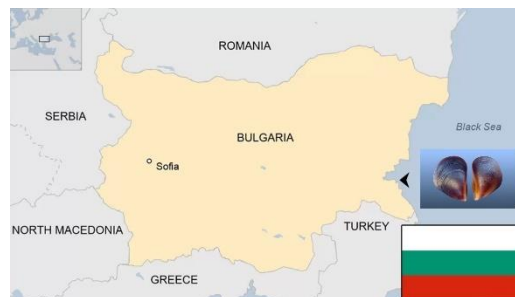
Fig. 1. Map of Bulgaria, showing the location of the town of Sozopol.

A total of 200 adult specimens (length 5.5 \text{ cm} \pm 2.5 ; weight 13.5 \text{ g} \pm 0.5 ) were purchased from a commercial farm located in Sozopol, Bulgaria in the end of January 2024 (Fig. 1).