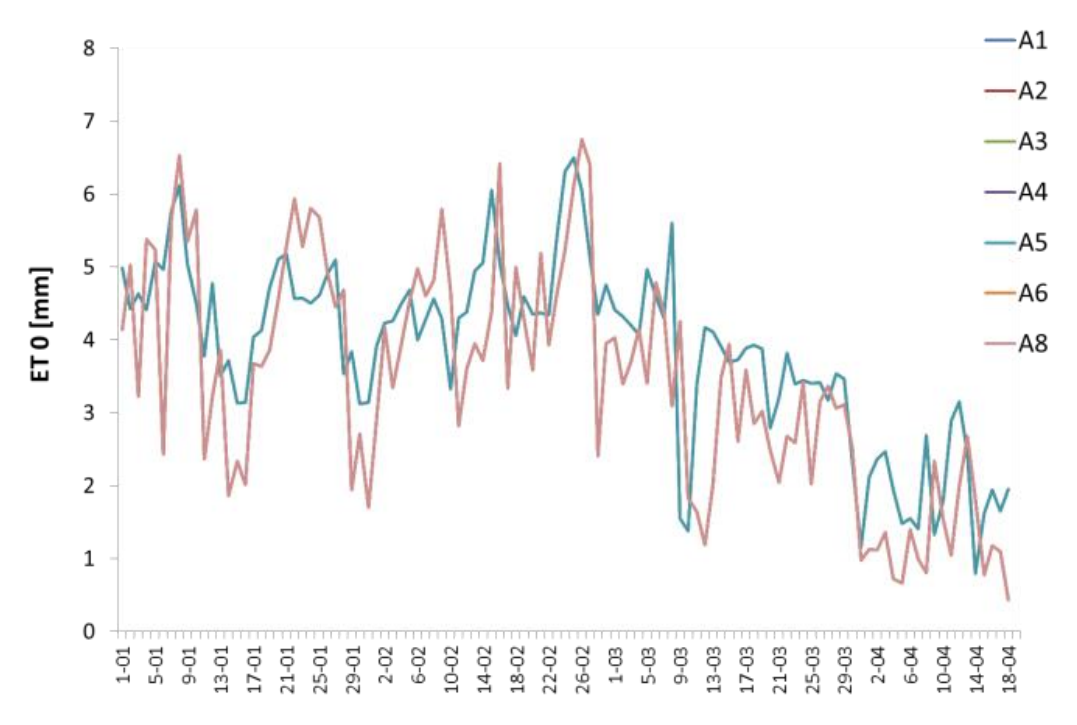
Figure 3. Modelled ET0 for various system setups. (WRF-based, non-AWS scenarios: A2,A3,A5blue)

Moreover, the results for potential evapotranspiration (Fig. 3) estimated with the use of automatic weather stations (scenario A8 plus A1, A4, A6) and WRF (A5 plus A2, A3) shown similar variability of evapotranspiration. However WRF estimations indicated in general lower amplitudes of changes than measured data.