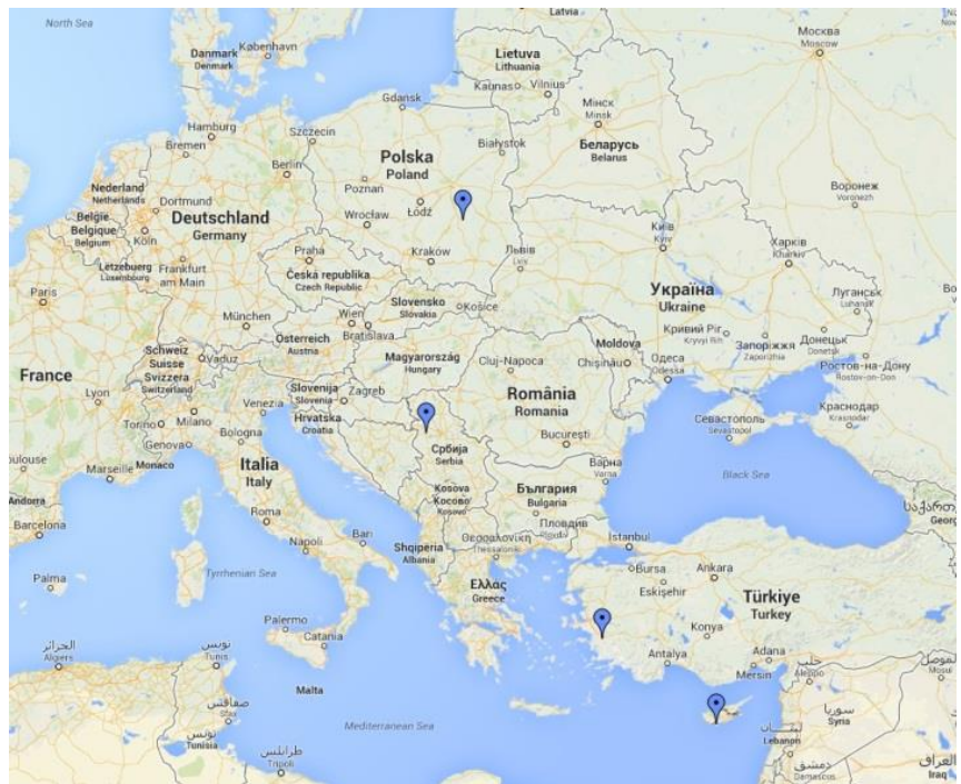
Figure 4. Locations of ENORASIS pilot sites.

crop types in three different climate regimes (North Central Europe-Poland, South Central Europe-Serbia and Mediterranean-Turkey and Cyprus) and within the context of three different operational settings / approaches (research farms, production farms and water management organisations).