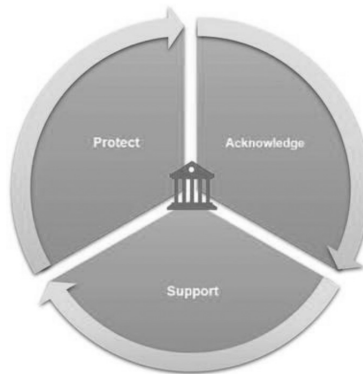
Figure 1. Requirements for Safeguarding Cultural Heritage

Considering these aspects, it can be affirmed that safeguarding cultural heritage is a crucial responsibility of the state and public administration authorities. This involves fulfilling three major requirements: acknowledging, supporting, and protecting cultural heritage ( Figure 1 ) (Florea et al., 2020).