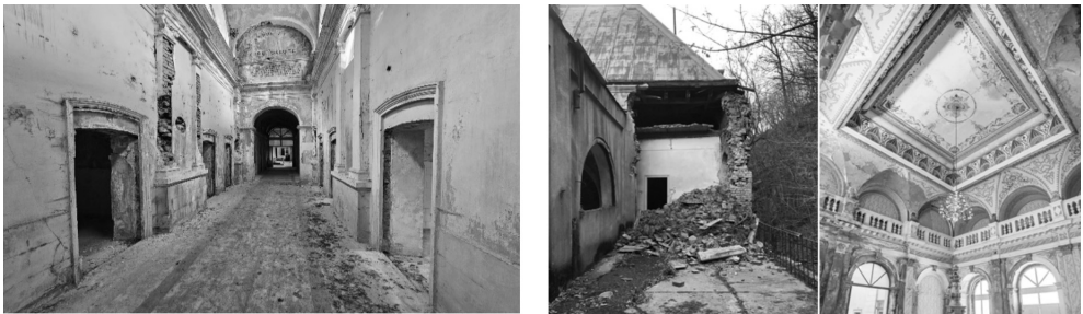
Figure 5. Băile Neptun degradation situation