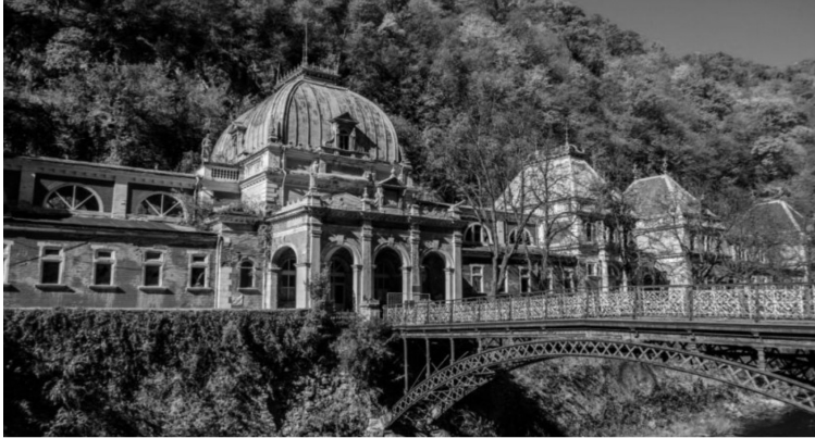
Figure 2. Băile Neptun/ Neptun Baths and the iron bridge over Cerna River