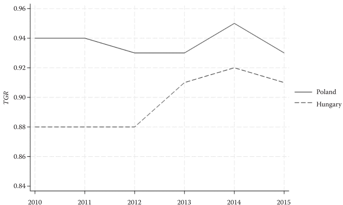
Figure 2. Evolution of the technology gap ratio ( TGR ) in Poland and Hungary in the years 2010–2015

The objective of this animal welfare aid is to compensate farmers for additional animal welfare commitments. It includes several measures that might contribute to more efficient production, e.g. ensuring the humane handling and transport of animals, ensuring an appropriate building microclimate, or ensuring that feed is free of undesirable substances. In addition, other potentially efficiency-enhancing