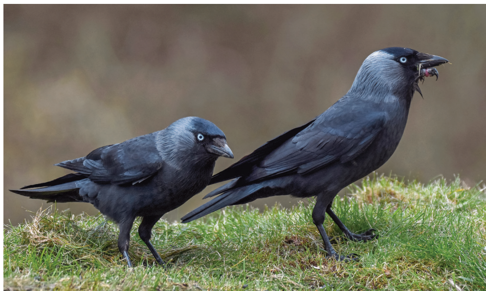
Figure 1. Two Western Jackdaws ( Corvus monedula ) in Woolacombe, North Devon, UK, where they were feeding at the edge of a woodland on the 4 th of April 2018. The bird on the right displays an oral fistula where the tongue extends through an opening (fistula) in the floor of the bird's oral cavity from where it is permanently excluded

1. ábra Erdőszélen táplálkozó csókák ( Corvus monedula ) Woolacombe, North Devon, UK területén 2018. április 8-án. A jobb oldali madáron jól látható az a rendellenesség – szájtejéki sipoly (oral fistula) –, ami elsősorban az alsó csőrkvát érinti, azon egy nyílást képezve, melyen keresztül a madár nyelve a csőrön kívülre záródik