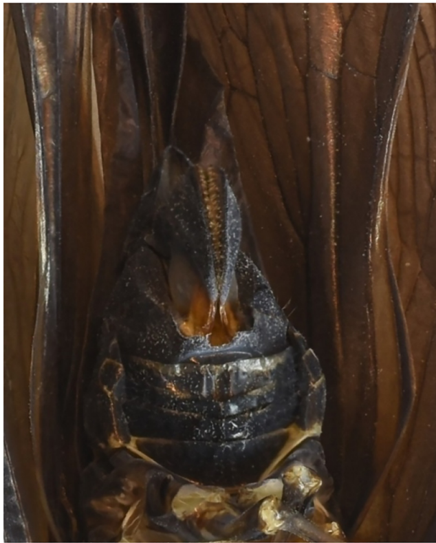
Fig. 3. The female anal segment of Pochazia shantungensis

these records and the status of the species in each country. In Belgium the species was probably imported from northern Italy, probably on Photinia sp. (Johan Verstraeten pers. comm.). The current known distribution in Europe according to the literature together with data from iNaturalist and GBIF.org and present records is given in Fig. 5 . The map was created with mapchart.net by Balázs Károlyi (available from https://www.mapchart.net/europe.html ).