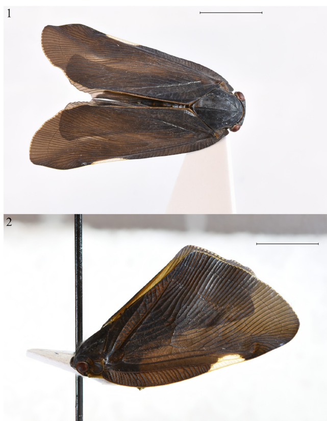
Figs 1–2. The habitus of Pochazia shantungensis : 1. Dorsal view, Scale bar = 0.5 cm; 2. Lateral view (female)