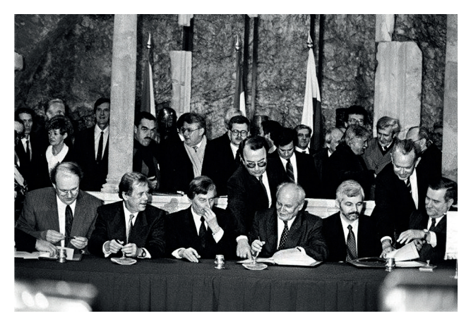
Figure 1. Signing of the Visegrad Declaration [14]