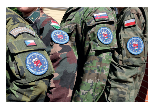
Figure 3. Visegrad EU BG [15]