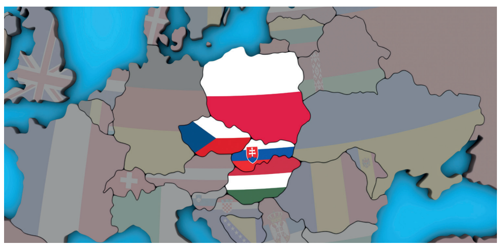
Figure 2. Map of the Visegrad Group [13]