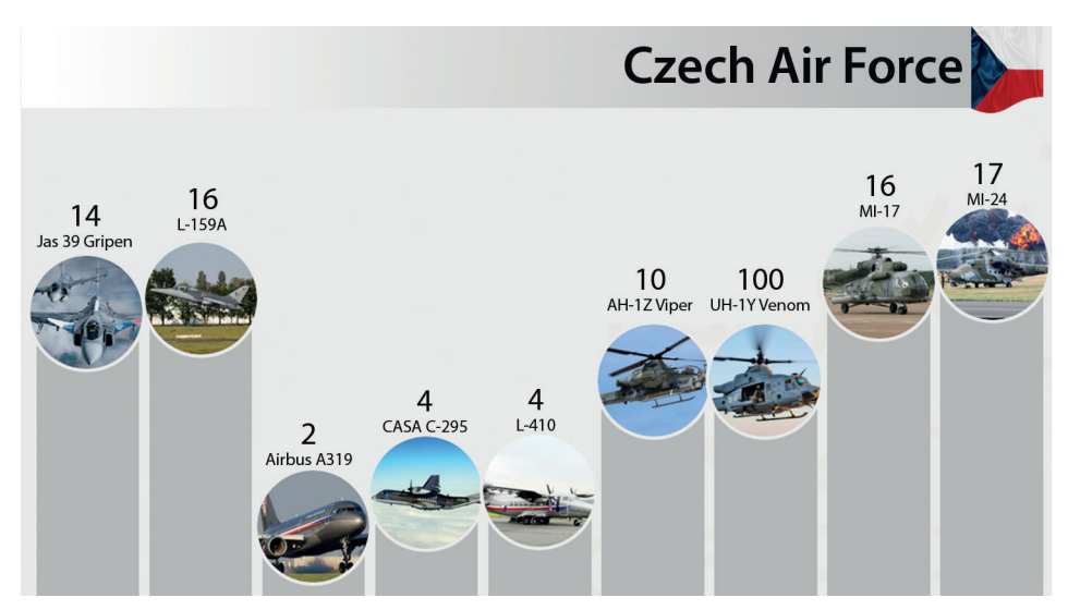
Figure 4. Aircrafts of the Czech Air Force [16]