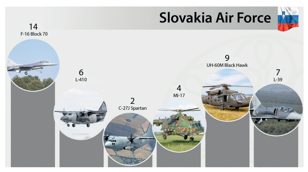
Figure 7. Aircrafts of the Slovakian Air Force [16]