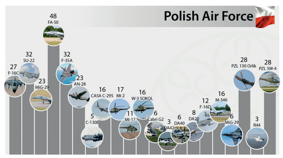
Figure 5. Aircrafts of the Polish Air Force [16]