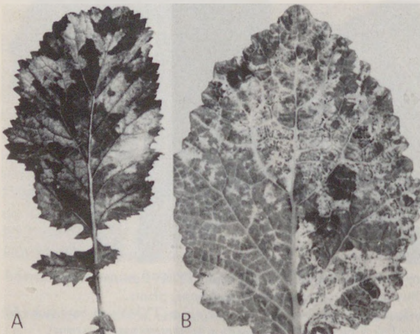
Fig. 2. Symptoms on Brassica campestris (A) and Crambe abyssinica (B) test plants inoculated with turnip yellow mosaic virus (TYMV).

The isolate PC obtained from Pak-Choy plants proved to be readily transmissible to several cruciferous plants (Table 1). The susceptible plants responded with typical vein clearing and bright yellow mosaic symptoms (Fig. 2A and B). Pak-Choy (cv. 'Japro RS 2701') showed the