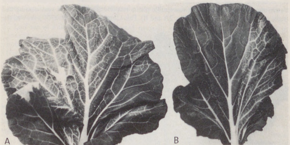
Fig. 1. Symptoms caused by PC isolate of turnip yellow mosaic virus (TYMV) on naturally (A) and artificially (B) infected leaves of Pak-Choy ( Brassica campestris var. chinensis ) plants.

The influence of the isolate from Pak-Choy (isolate PC) on plant cells was analyzed by a light microscope. The observations were carried out on tissue sections taken from midrib on