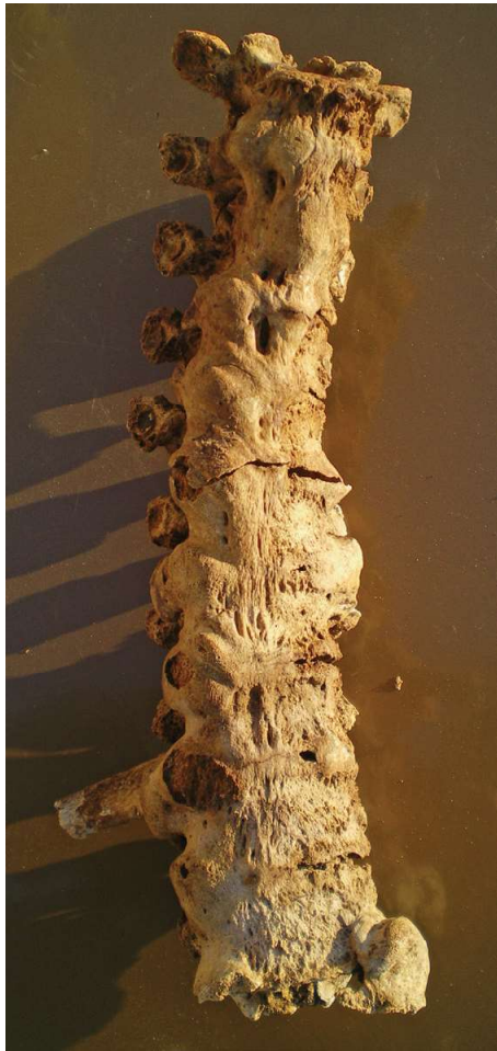
Figure 11: Two third of the vertebral column is completely fused by DISH