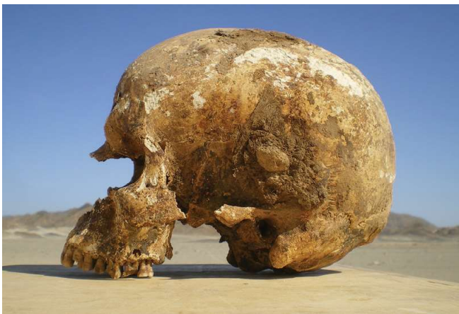
Figure 6. The relatively well preserved skull of the approximately 60-70 years old man