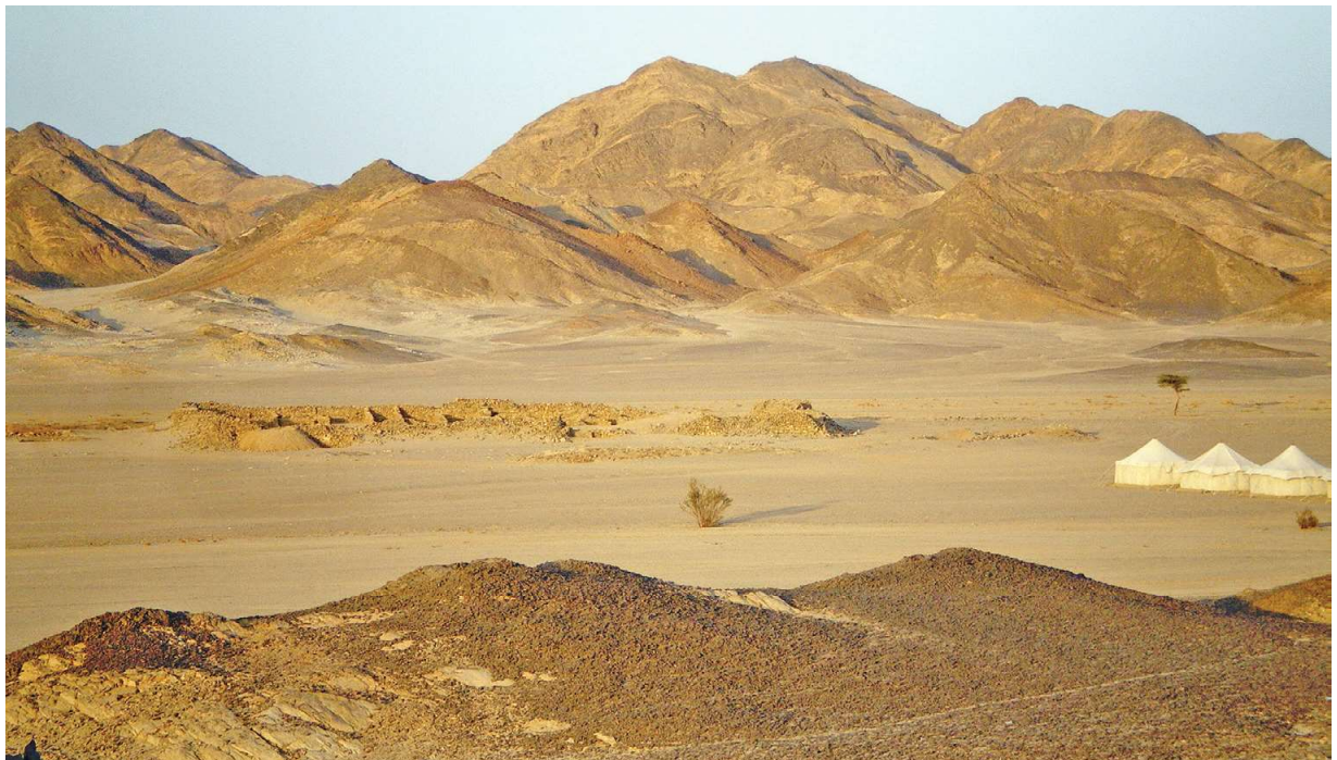
Figure 2. The excavation of the Roman praesidium of Dios and its environment