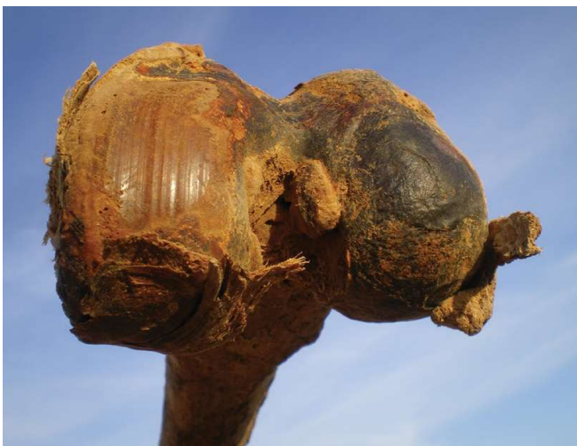
Figure 8. Lower extremity of the left femur presenting traces of knee arthrosis