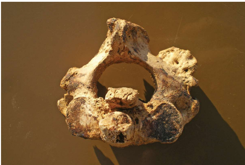
Fig:13: Ossification of the posterior longitudinal ligament (OPLL) in the cervical spine