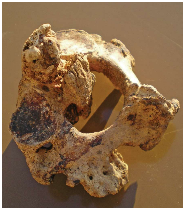
Figure 14: Traces of extensive OPLL and degenerative articular changes on the second cervical vertebra

In this short case history only a brief overview of the main pathologies of this male skeleton was given. Seeing the presented alterations we can conclude that our subject individual had suffered for a long time before his death from several serious conditions, especially because of the dental diseases and the severe osteoarthroses of the right shoulder and the left knee. Probably the most serious conditions could have been the associated DISH and OPLL. But neither the degenerative joint changes, nor the ossifying metabolic disorders could explain the observed special burial conditions. We cannot explain why this man was buried in the dump, few meters from the gate