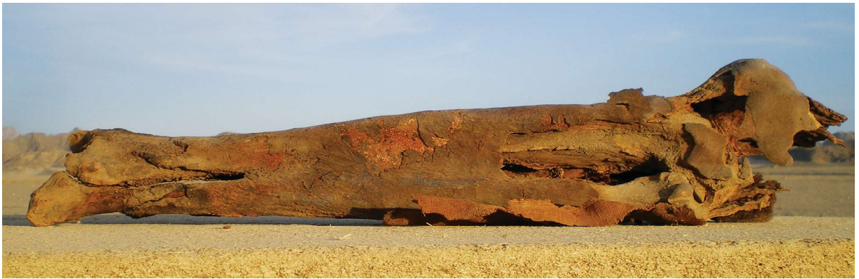
Figure 5. Mummified part of one of the lower limbs