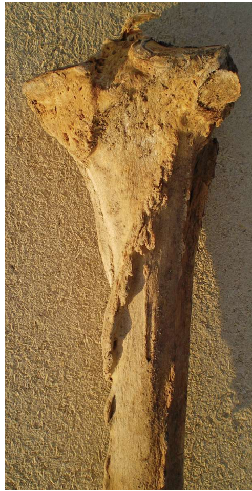
Figure 12: Calcified/ossified entheses on the posterior face of the right tibia