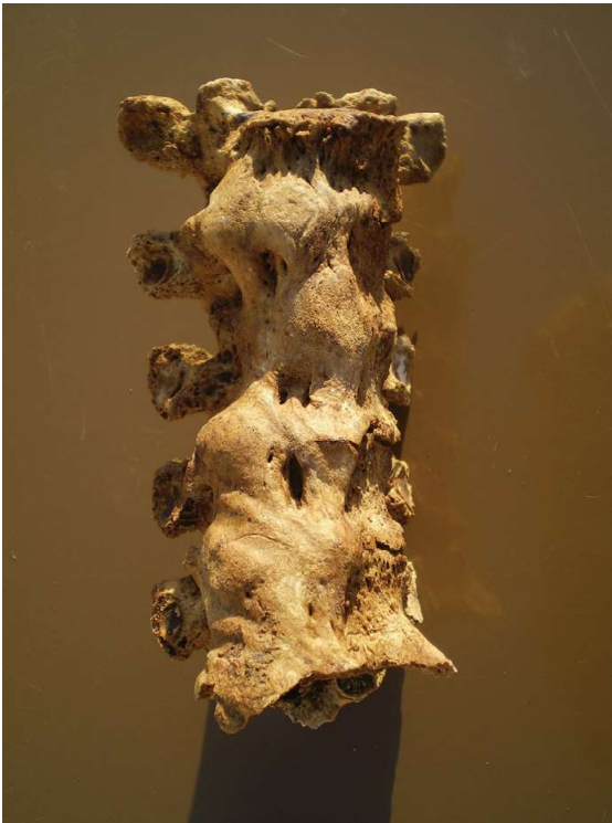
Figure 10: Thoracic spine with ossified spinal ligaments (DISH)

body parts enabled direct observation of the bones and the identification of several paleopathological conditions. Traces of periapical abscesses, periodontitis, sinusitis and periostitis were observed on the maxillae, indicating very poor dental hygiene (Figure 7). The right shoulder and the right sternoclavicular joint were affected by degenerative articular processes. Osteoarthritis affected several articulations of the hands and the feet. In spite of the better-state mummification of the left lower limb, direct macroscopic observation could reveal eburnation on the left femuro-patellar joint surface, due to severe osteoarthritis of the knee (Figures 8 and 9).