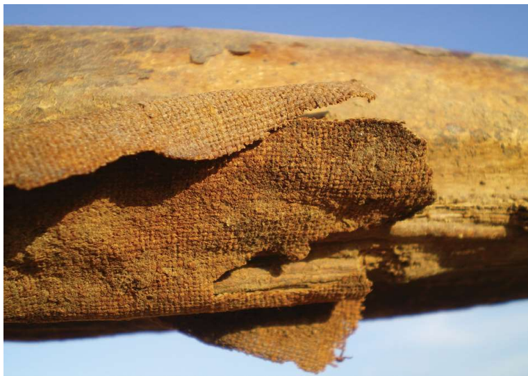
Figure 4. Remnants of the pitched shroud used for prevent the decomposition of the body

The anthropological study of the material was carried out in 'quasi in situ' conditions at the Dios archaeological site. To estimate sex, age at death and height, we used accepted anthropological methods. 3 The identification of paleopathological conditions was performed using macromorphological observations and the classical paleopathological and medical literature. 4