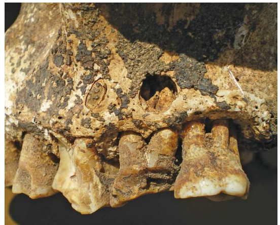
Figure 7. Traces of periapical abscess periodontitis on the left maxilla