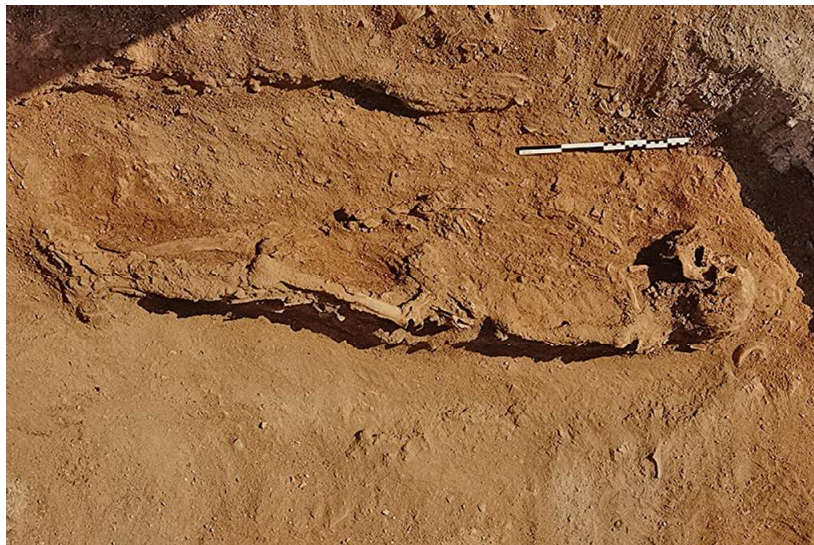
Figure 3. The grave was discovered in the rubbish dump of the praesidium