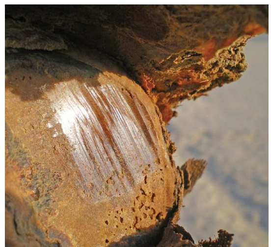
Figure 9. Severe arthrosis of the left knee: the partial mummification of the left lower limb don't mask the advanced stage eburnation and remodelling of the left superior epiphysis of the tibia