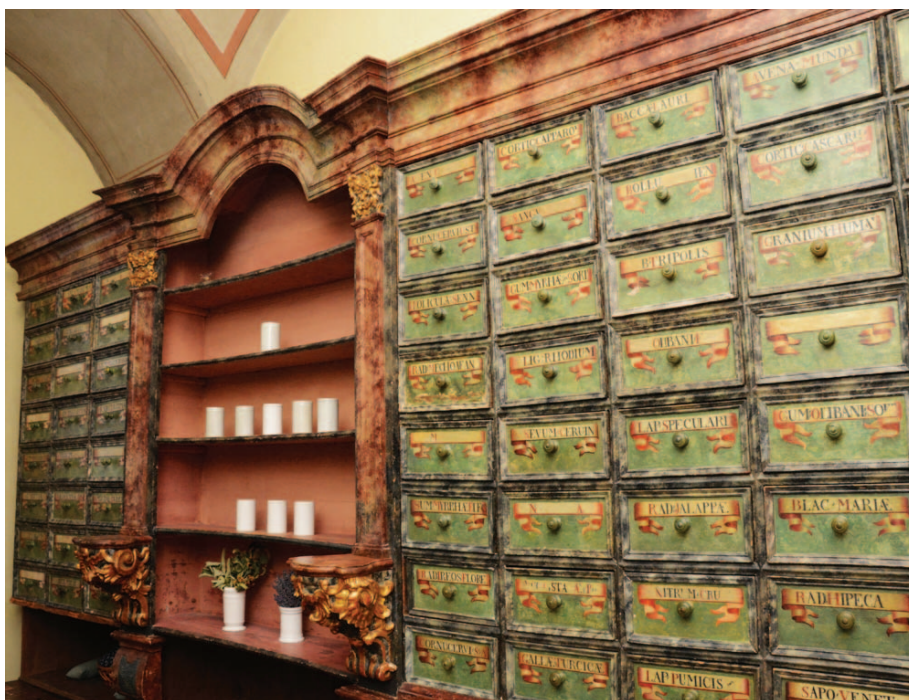
Figure 1. Drawers in the Fekete Sas Pharmacy Museum.

The 43 chapters of the „book” of compositae already follow each other in an alphabetical order. Among the complex preparations we can also find many pharmaceutical forms that are hardly known today. Such as, for