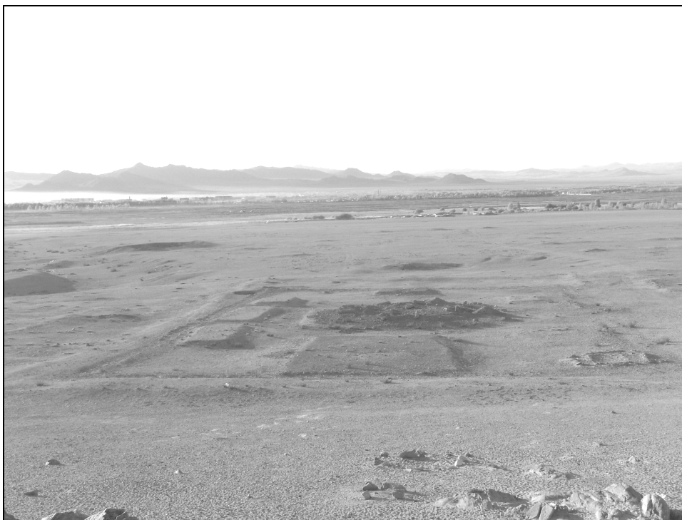
Figure 3. Ruins of Šar süm in Xowd province, 2010

xošuu . 13 As for sum monasteries Pozdneev defines them as solitary steppe temples, around with three or four yurts (1978, p. 43). Sometimes the sum monasteries consisted of only a wooden temple and some buildings. Its operation was not guaranteed, so at first ceremonies were started enthusiastically, then, monks left for their nomadic lands, and finally gathered only at great ceremonies for a couple of days of the year. The monks were self-supporting.