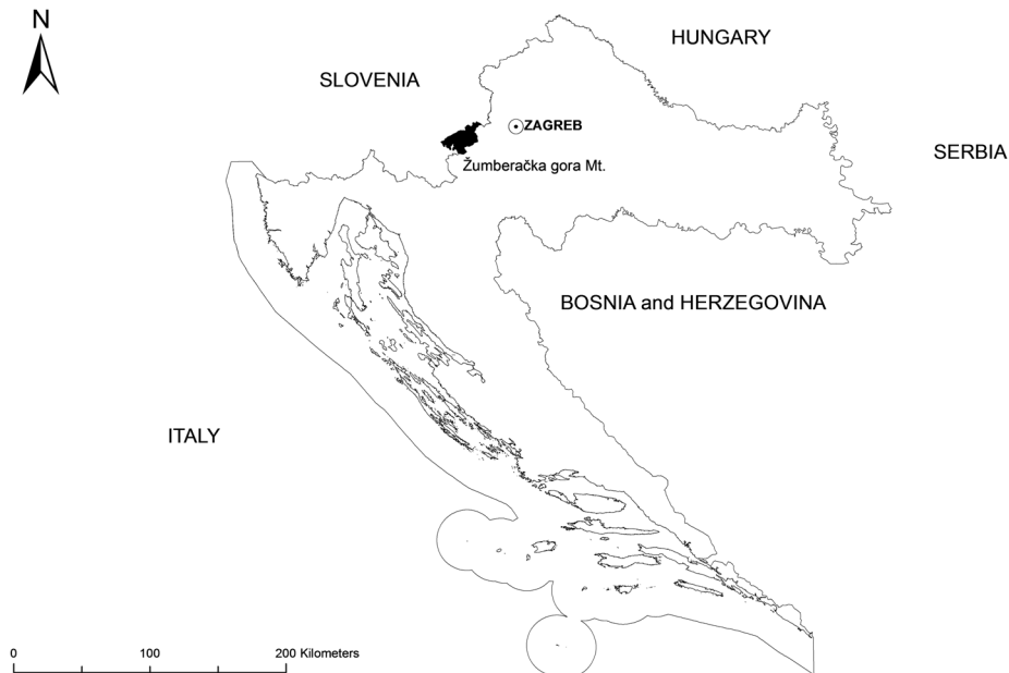
Fig. 1. The investigated area.

2. Žumberačka gora Mts, Pogana jama pit at Kuta, pit and surrounding limestone rocks, 45.79161° N, 15.43128° E, 875 m, 23.07.2014.