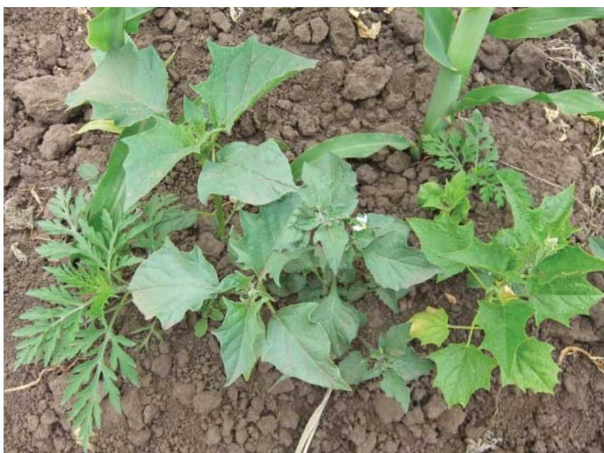
Figure 3: Distribution of weed dominance at Nagyhörcsök on 19 June 2012

*Significant differences in weed density among the treatment: LSD 5% was 4.61 for HELAN, 2.93 for HIBTR and 1.69 for STAAN