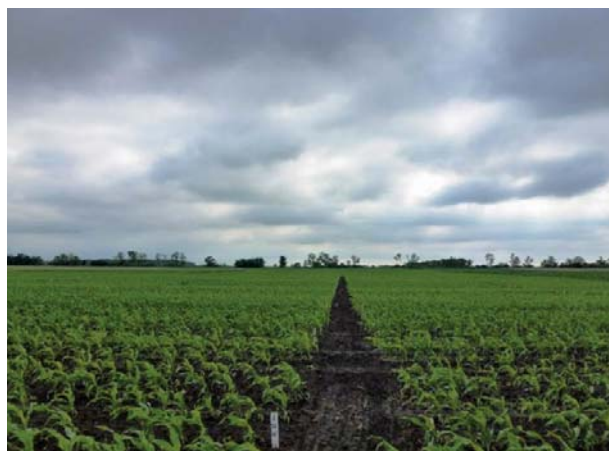
Figure 1: The experimental area at Nagyhörscök in 2013

Fertilization was carried out as treatments [control (Ø), PK, NK, NP, NPK] with different active ingredients, the