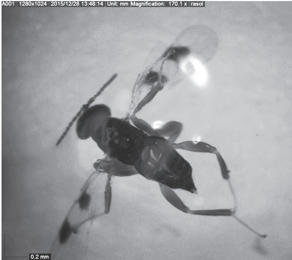
Fig. 3. Cheiropachus quadrum (male)