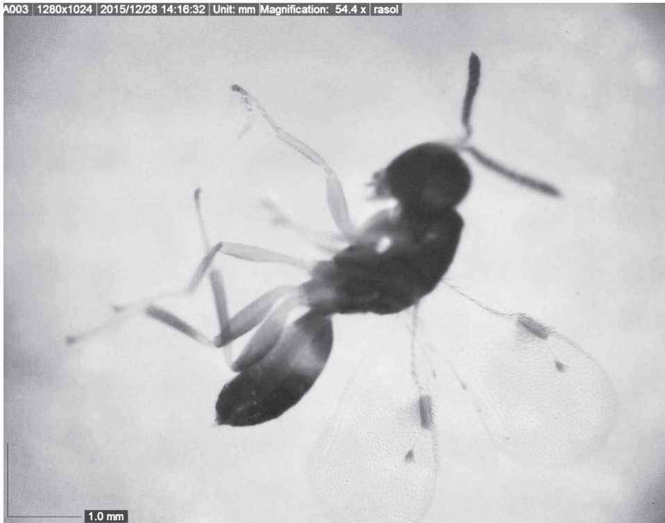
Fig. 4. Rhaphitelus maculatus (male)

R. maculatus was first reported from Iran by Radjabi (1989) from Markazi, Zanjan, Hamedan and Esfahan Provinces then Lotfalizadeh (2012) collected it from East Azerbaijan and Davatchi and Chodjai (1968) reported it from Karaj and Ardebil. This species has short club-like antenna and a few erect setae on hind coxa (Fig. 4).