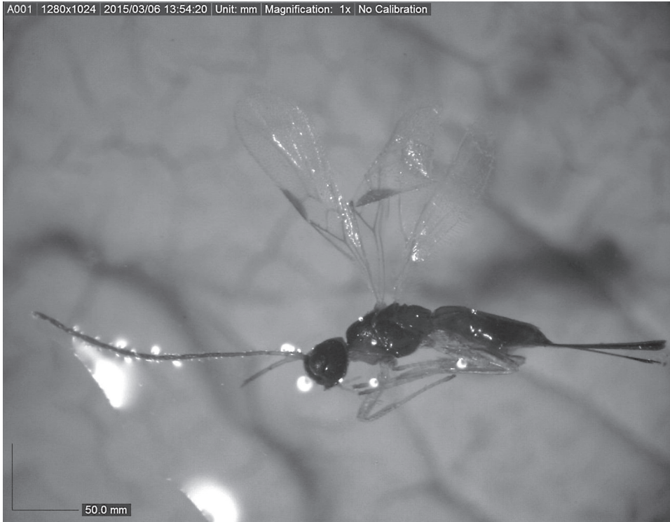
Fig. 1. Ecphylus silesiacus (Female)

closely related species like E. caudatus by the following morphological characters: body color is dark brown to black; absence of Cu vein in forewing, developed costal vein in hind wing and closed basal cell; ovipositor as long as the abdomen (Farahani et al., 2014) (Fig. 1). In recent studies, several hosts were recorded for E. silesiacus such as Dryocoetes villosus (Fabricius, 1792), Orthomicus laricis (Fabricius, 1792), Ipstypo graphus (Linnaeus, 1758), Ptelobious vitatus (Fabricius, 1787), and Trypodendron domesticum (Linnaeus, 1758), but in this study, a new host called T. lenkoranus was identified for the first time. T. lenkoranus is an important pest in the forests of northern Iran. This species was collected for the first time by Amini et al. (2013) from Guilan province. The most important morphological characters of T. lenkoranus are as follows: Body length is 1.8–2.3 mm, cylindrical, dark brown, covered by long hairs. The frons in male were covered with short and sporadic hairs; female with topknot hair in the middle with projections Pronotum cylindrical, longer in width Pronotom with projections anteriorly and dotted posteriorly; elytra covered with large striated punctures. The back slope of elytra in female was concave and in male, it was more or less flattened with a shining circular surface and small punctures; length of elytra was 1.65–1.75 mm (Pfeffer, 1995) (Fig. 2).