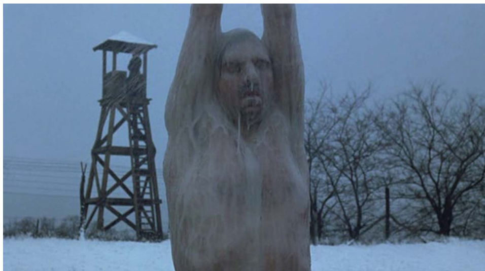
Figure 1. Father and son: Ádám encased in frozen water.

All of this is in stark contrast to the way Szabó uses the body. In Sunshine , the visual representations of the body are configured as less mechanical, more humanistic, psychology-driven metaphors. For example, one of the central body metaphors of the film is the relation between the body of Ádám (the Olympic champion fencer who died in a concentration camp) and his son, Iván (who became a member of the communist state security forces). The father dies encased in frozen water, while the son – who witnessed his father's death – is later shown covered in water in the shower while his superior attacks him and calls him a traitor (Figures 1 and 2).