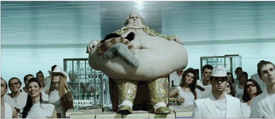
Figure 3. Father and son: the stuffed body sculpture of the father.