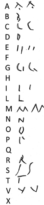
3. The letters used in the Siscia tablet (author's illustration)