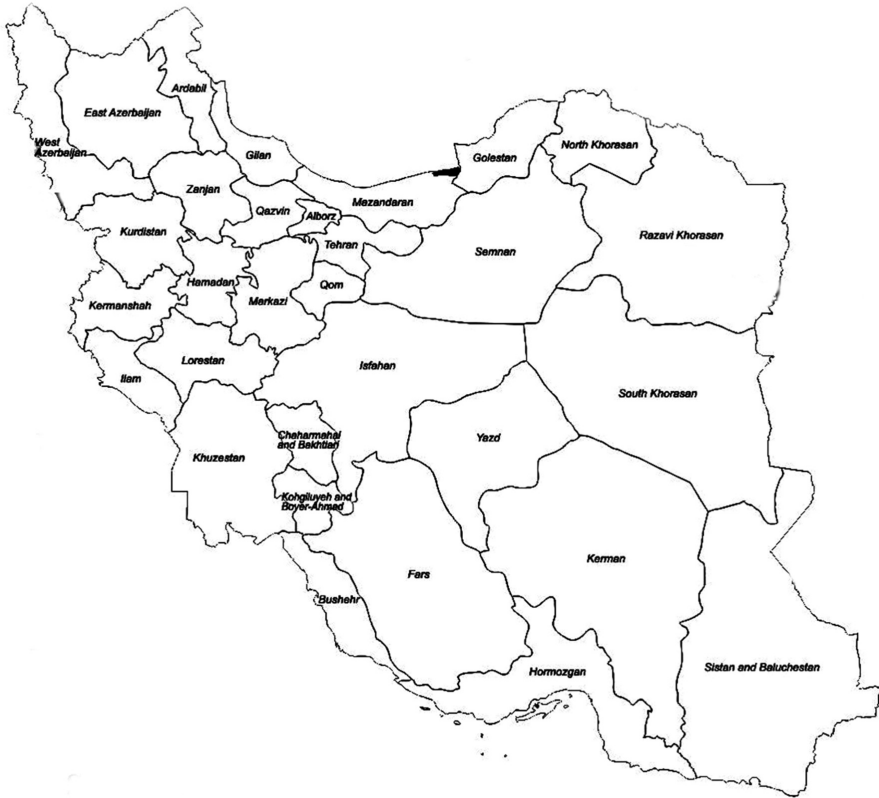
Fig. 1: Map of Iran with provincial boundaries