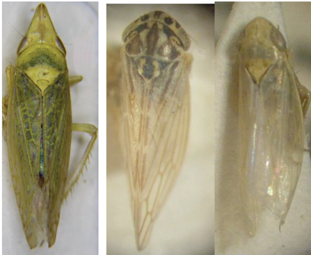
Fig. 1. Platymetopius shirazicus Dlabola, 1974, Agallia ribauti Ossiannilsson, 1938, Psammotettix alienus (Dahlbom, 1850)

RFLP analysis of the R16F2n/R2 and M1/M2 products with TaqI and MseI (Fig. 2) indicated that the phytoplasmas from grapevine leafhoppers in Qazvin province (Iran) are mixed infection of two different group 16SrII (' Candidatus Phytoplasma aurantifolia') and 16SrXII group ( Ca. P. solani , "stolbur") (Fig. 2). But single infection was observed in three populations of seven positive populations that related to A. ribauti species. Sequencing and blast analysis of these samples indicated that this phytoplasma related to the 16SrII (' Candidatus Phytoplasma aurantifolia') group and shared 100% similarity